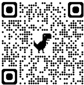
State of NC required vaccines for School

The development of vaccines is considered one of the greatest public health advances of the past century. Our practice has created this policy to protect children and adolescents from life-threatening diseases that are preventable. We are dedicated to the health and well-being of our patients and community.